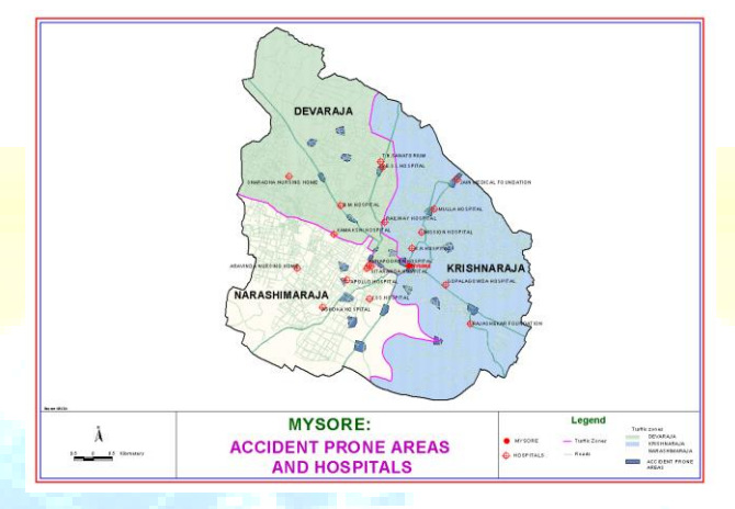
Map No 2

The traffic rules laid down by the Government should be followed in order to reduce traffic problems. But the people do not follow or obey the rules, such as stopping at signals, one-way entry, horning and driving without licenses.